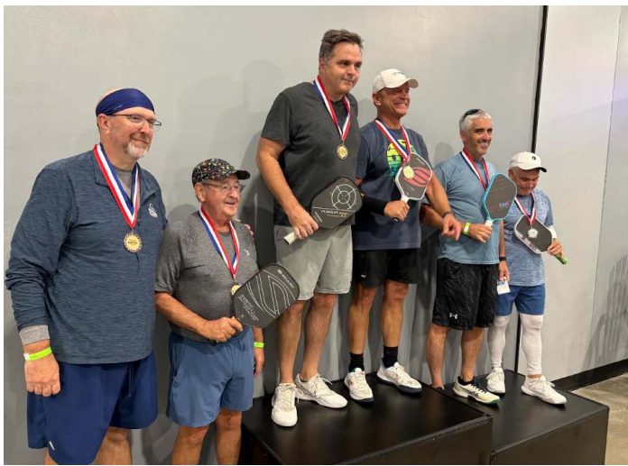
Celebrating our winners!