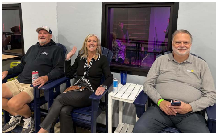
The Westerville Sunrise Rotary Cheering Section.